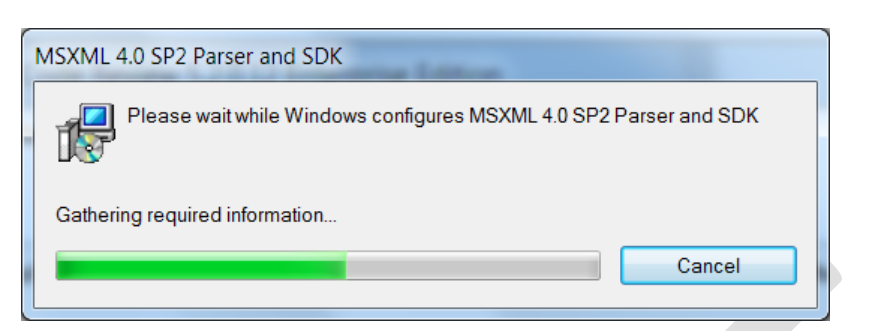
Figure 9 Install MSXML

Installing RescueNet Code Review: Install RescueNet Code Review