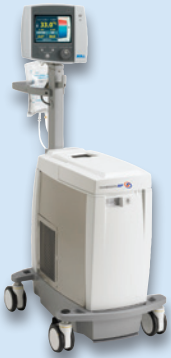
The Thermogard XP® (TGXP) Intravascular Temperature Management System (IVTM™)

Please refer to Catheter Indications for Use reference literature or visit www.zoll.com .