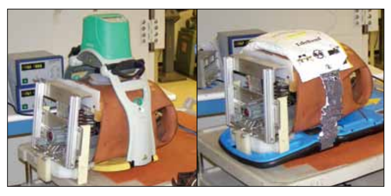
Figure 2 – The piston-driven (left) and load-distributing band (right) systems shown applied to the calibrated mannequin.