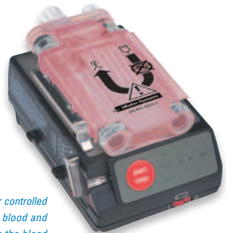
A compact pump also for controlled delivery of whole blood and pRBCs when used with the blood cartridge (shown in red).

The Power Infuser is just one of a full line of integrated resuscitation solutions designed to help rescuers improve practices and save lives. For more information, call 800-804-4356 or visit www.zoll.com .