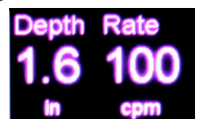
Figure 1. CPR Dashboard Display

Now there is light. The ZOLL R Series with the CPR Dashboard™ automatically switches to a pediatric display showing actual depth and rate of compression delivery in real time. (Figure 1)