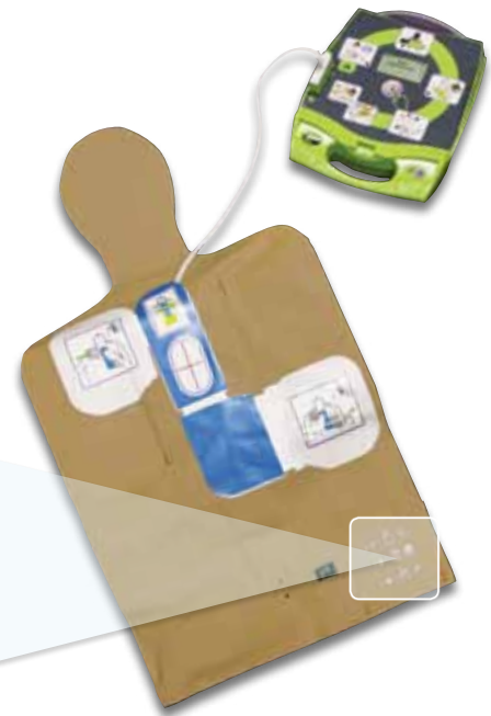
Real CPR Help Travel Trainer connects to a clinical AED Plus® or AED Pro®.