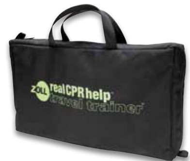
One-piece zippered carry case simplifies transport and storage.

When connected to the Travel Trainer, the AED Plus and AED Pro limit defibrillation output to a low-energy, 5-joule pulse, reducing the shock level and preserving the battery capacity of the AED during demonstration or training.