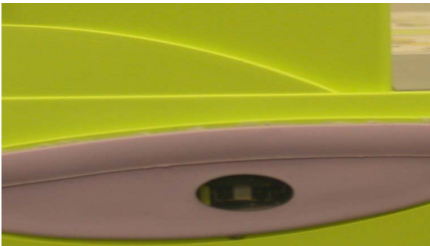
AED Plus IrDA Port