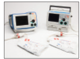
OneStep Electrode Pads are compatible with ZOLL® R Series® and M Series® defibrillators.