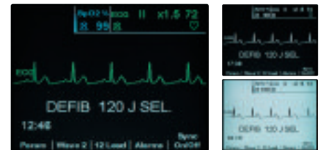
The EasyRead Tri-Mode Display provides three screen options: high resolution color, black on white, or white on black.

Accepts two standard series Type II Flash Cards, 2, 4, 16, and 32 MB. Fax modem card capability in slot 1, data cards in slot 2.