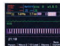
Depth and rate versions of the Real CPR Help Screen