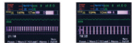
Depth and rate versions of the Real CPR Help Screen