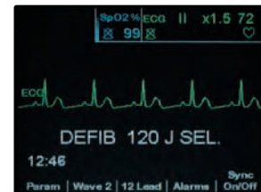
The EasyRead Tri-Mode Display provides three screen options: high resolution color, black on white, or white on black.

Accepts two standard series Type II Flash Cards, 2, 4, 16, and 32 MB. Fax modem card capability in slot 1, data cards in slot 2.